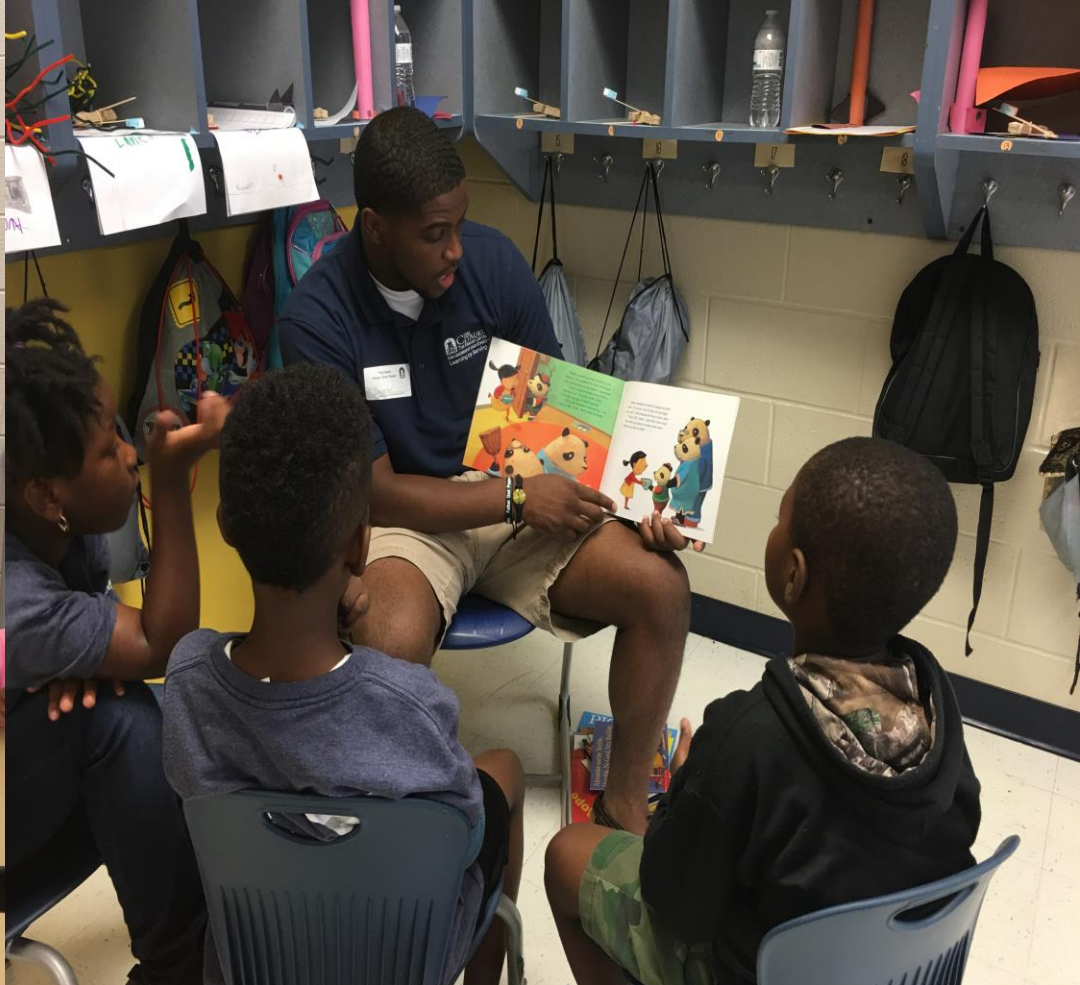
Summer SUCCEED program